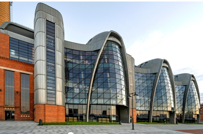
Ec1 Lodz - City of Culture