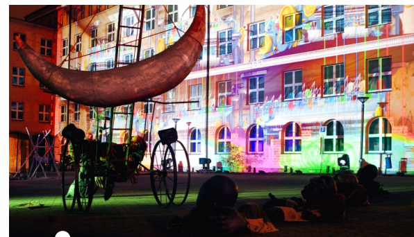
Light Move Festival