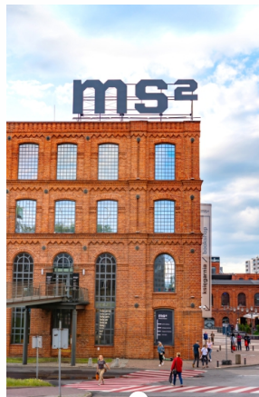
Museum of Art in Lodz