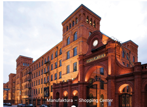
Manufaktura – Shopping Center